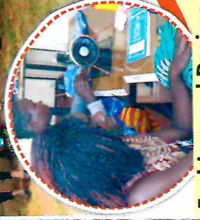
Fashion and Design