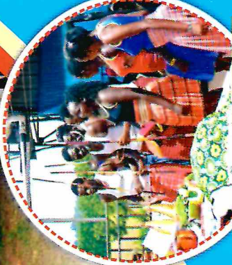
Culture and diversity